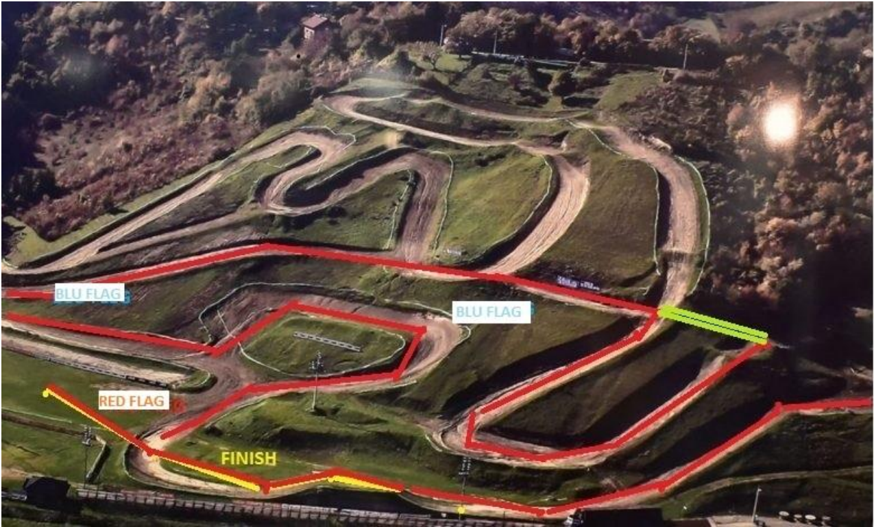
TRACK EMX 65 SW YELLOW MARKED EMX 65, POSSIBILITY OF SHORTENING