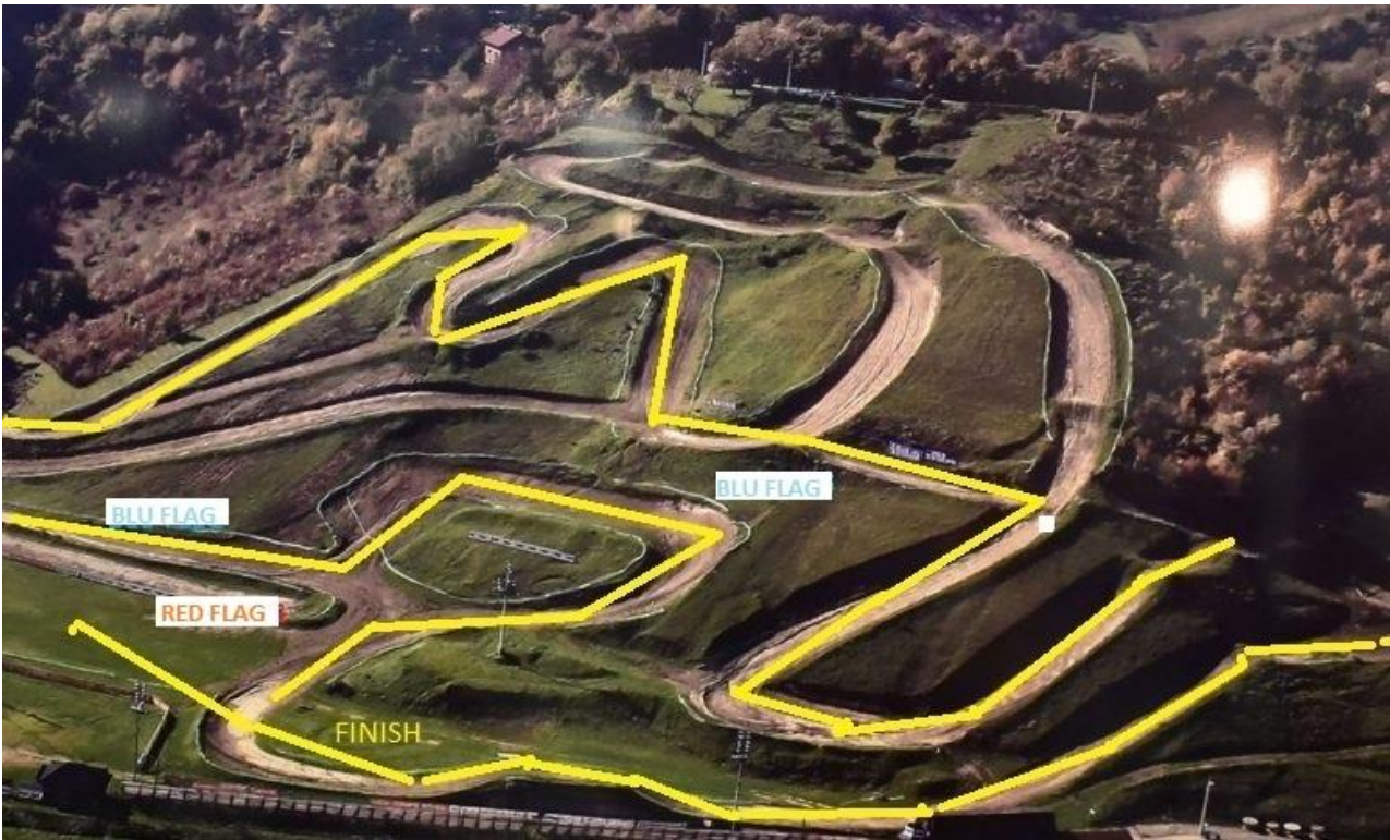
TRACK EMX 85 SW